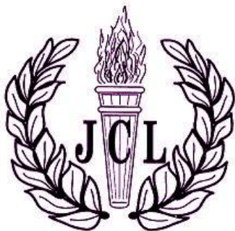
Kennesaw Mountain High School JCL- State Convention 2011